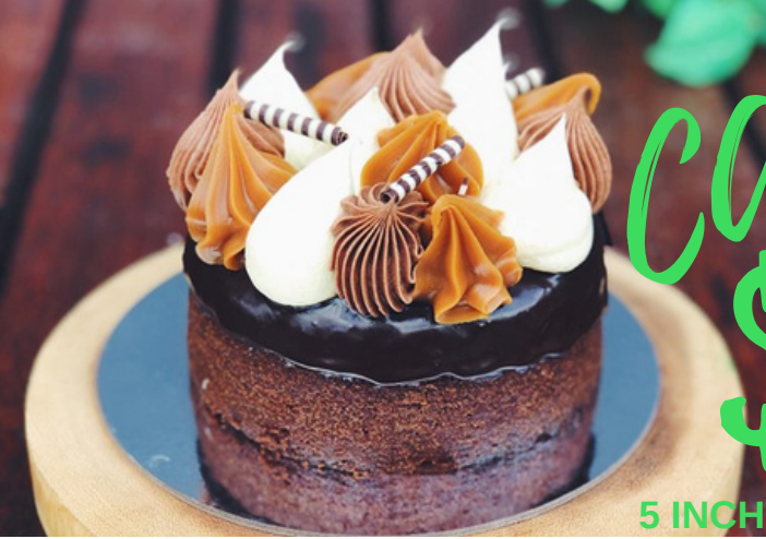
5 INCH BABY CAKE